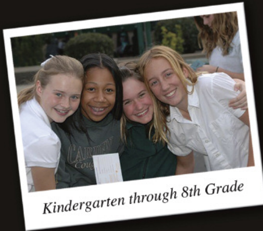
Kindergarten through 8th Grade

"Parents can give their children two things: unconditional love and an education. Everything else is a variable."